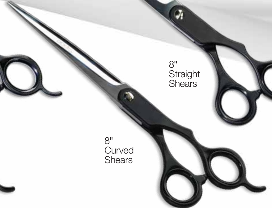
8" Curved Shears