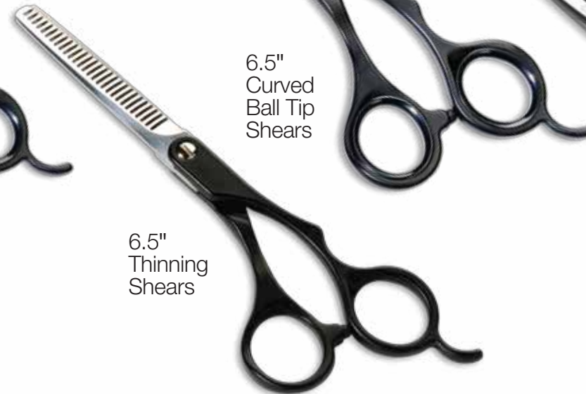
6.5" Thinning Shears