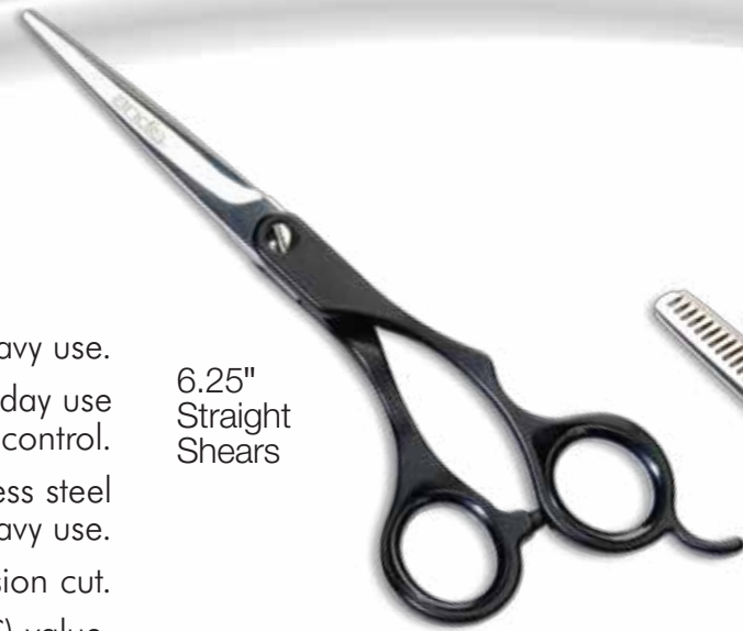
6.25" Straight Shears