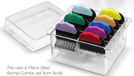
The new 8-Piece Steel Animal Combs set from Andis features durable stainless-steel tines and color coding for easy identification.

8-Piece Steel Animal Combs set. These heavy-duty attachment combs snap on and off quickly and the best part is that they work with either the Andis UltraEdge® or CeramicEdge® size 10 or 30 blades. You'll save time without compromising on quality.